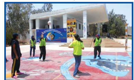
JMDC Girls Team participated in 12-Inter-University Throw Ball Championship held at Baqai Medical University Ground on April 24, 2014