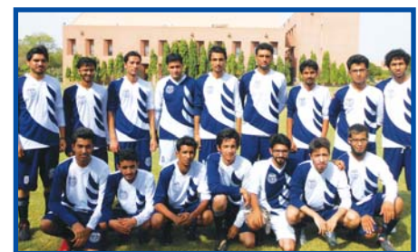
JMDC participated in 12-Inter-University Football Tournament held at AKUH Football Ground on May 16, 2014